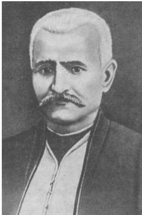
Mirza Fathali Akhundzadeh

Among those intellectuals are: Jalal e Din Mirza, the author of the book "Nameye Khosrovan" 3 , Mirza Fathali Akhundzadeh, author of "Maktoobate Kamal e Doleh" 4 , in which he seeks the establishment of a new phase for the concept of "Government" and cancellation of all the historical pillars of the Iranian state, as well as the abolition of Islam through a comprehensive Iranian renaissance along the lines of European Renaissance, and a return to the history of Iran at the time of Sasanian and Achaemenid empire and the reproduction of the political and cultural structures of those empires. 5