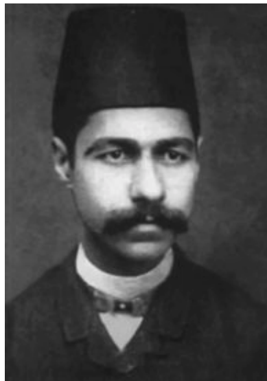
Mirza Aghakhan Kermani

chairmanship of "Theodor Herzl" in the city of Basel in Switzerland, which came to fruition in the "Balfour Declaration" in 1917, which led to the establishment of the Jewish entity. Most of these Zoroastrians were working for the British government of East India and, therefore, had a strong relationship with the colonial Britain. Their first step was persuading Nasser e Din Shah in order to give the Ahwaz region to these Zoroastrians for the purpose of establishing their desired historical entity, and the proposal of this plan was submitted by Mirza Aghakhan Kermani in his famous letter "Omran e Khuzestan" to Nasser e Din Shah 11 . Those plans were continued in coordination with the British colonizers in order to achieve this historical dream of the Zoroastrians.